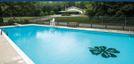
A more energy-efficient pool pump will help keep swimmers—and cost-conscious administrators—happy all summer long.