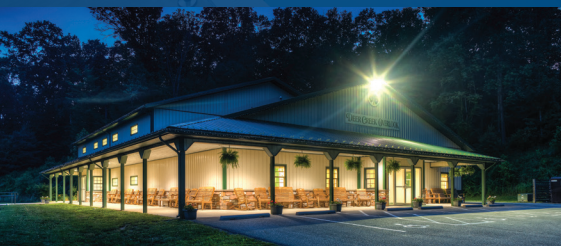
New exterior LEDs installed above the wraparound porch at Deer Creek Overlook create an inviting ambiance for lounging.

Structures on the site include Deer Creek Overlook—a multipurpose building and dining hall with seating for up to 290 guests—as well as Rocks Lodge, a caretaker home, dormitories, two pavilions and a swimming pool.