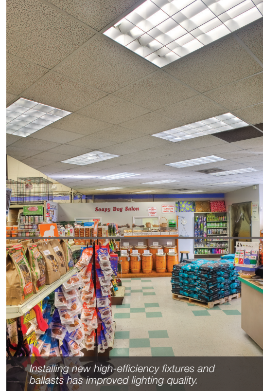
Installing new high-efficiency fixtures and ballasts has improved lighting quality.