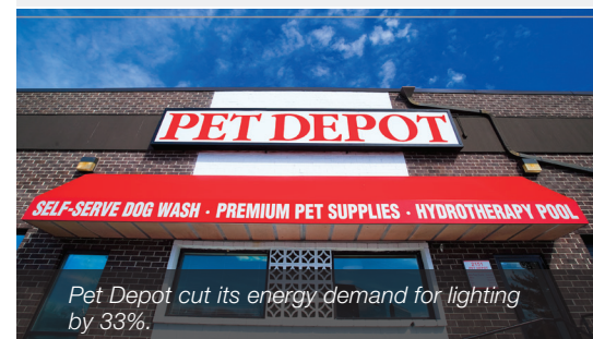
Pet Depot cut its energy demand for lighting by 33%.